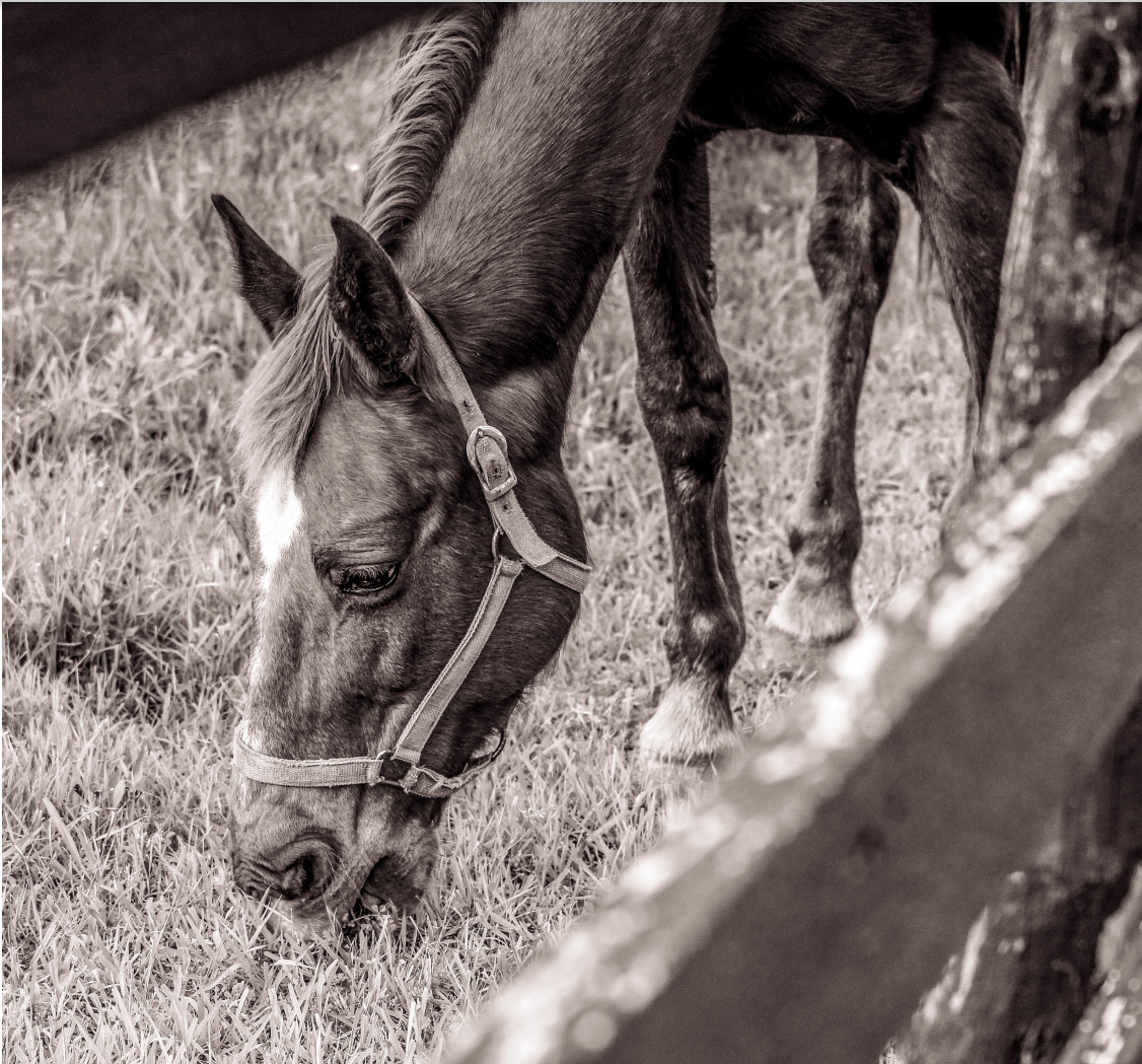
untitled , horse grazing in Ennis, Texas.