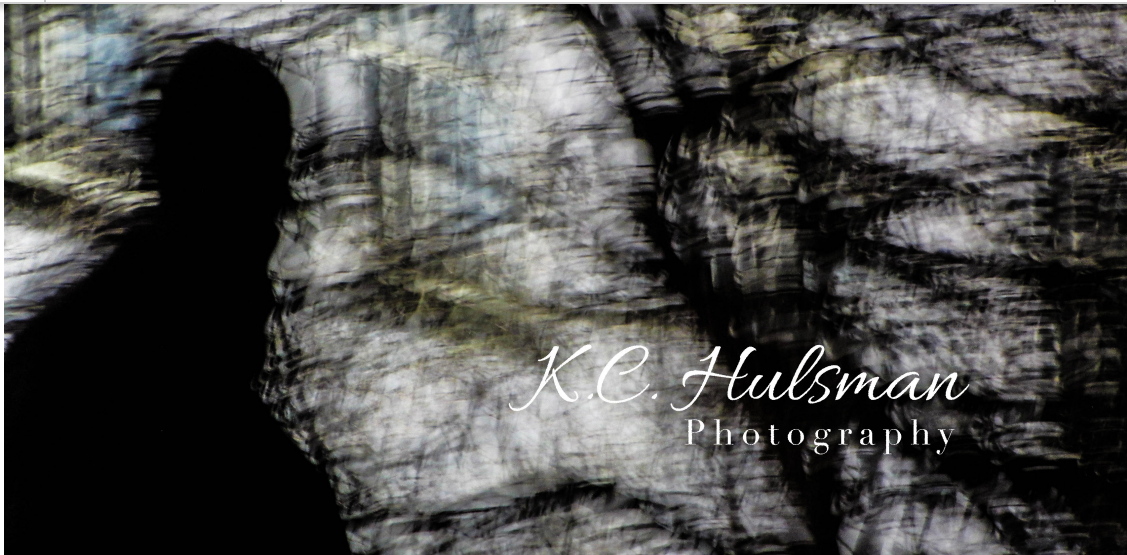
Silhouette of a Man During New Year's Fireworks Reflected on the water of the Thames River on January 1, 2013 in London, England.