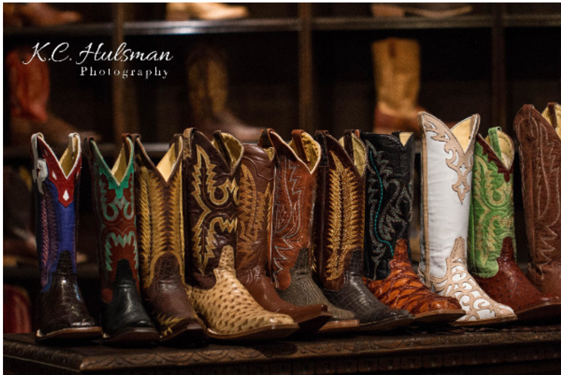
Rod Patrick Bootmakers, in Fort Worth, Texas

Thanks to Fort Worth Camera I had opportunities this past month to flex my photography muscles. My first outing was to Rod Patrick Bootmakers in Fort Worth during the Fort Worth Stock Show and Rodeo. Not only can they make you custom boots to fit you perfectly, but they are also the only bootmaker to offer in their ready-to-wear selection sizes 4-17 that also feature ten different widths (from EEE - AAAA). I had the freedom to run amok in their store, where I shot everything from the boots, to the leathers used to make the boots, to store shelves with other items for sale like some shirts. Fort Worth Camera had also provided access to a model for the evening.